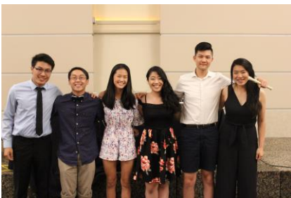
Bethune Music Council Executive

a great turn out and we are looking forward to further connecting with the grade 9s at our annual Arts Retreat at Geneva Park in Orillia!